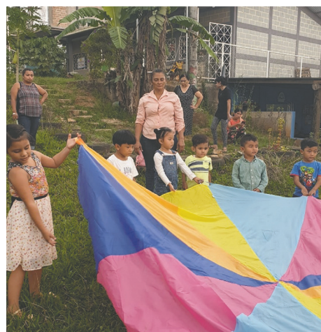
Learning your words for colors in English can be fun too!