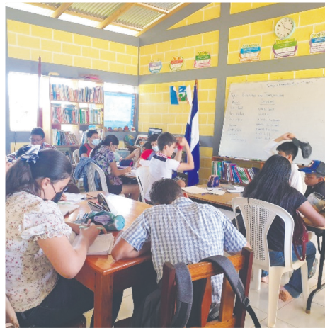
Journaling after reading a short story in English.