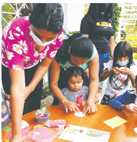
Creating art based on a book they just read.