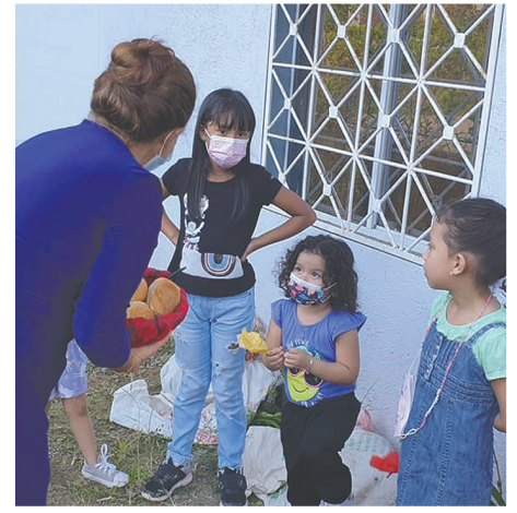
Discovering that the English word for the color ORANGE was also the word for a yummy fruit.