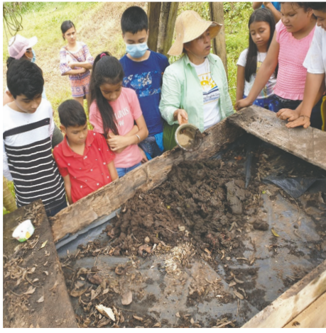
Learning about organic gardening from the bottom up.