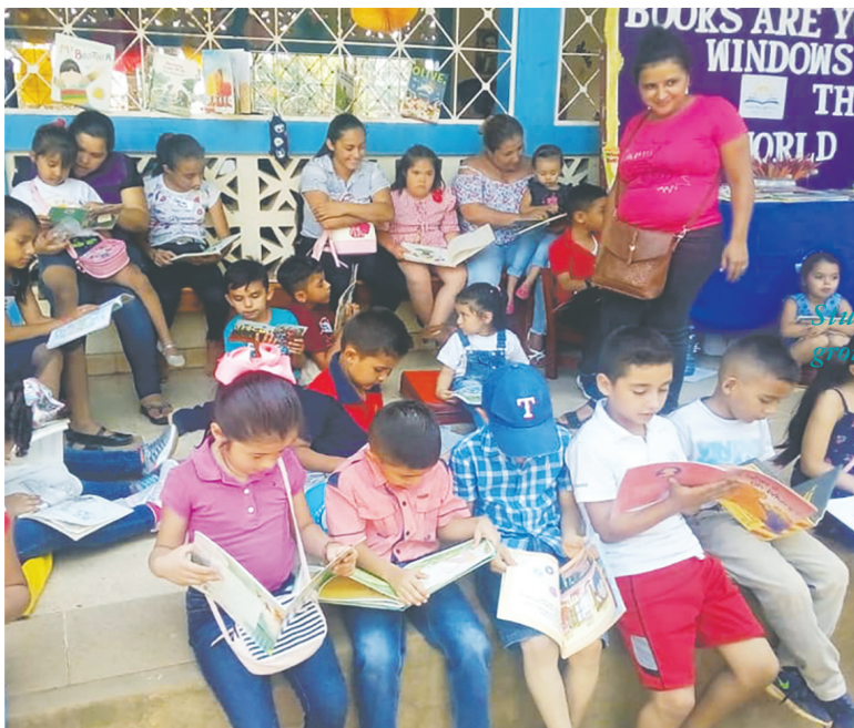
Reading books – windows to the world!