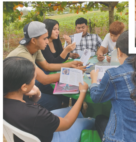
Practicing speaking English in a study group.