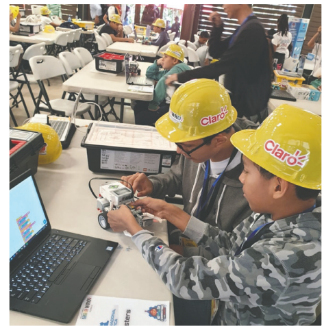
Winning prizes in the National Robotics Olympics.