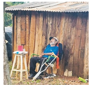
Moving independently means a better life