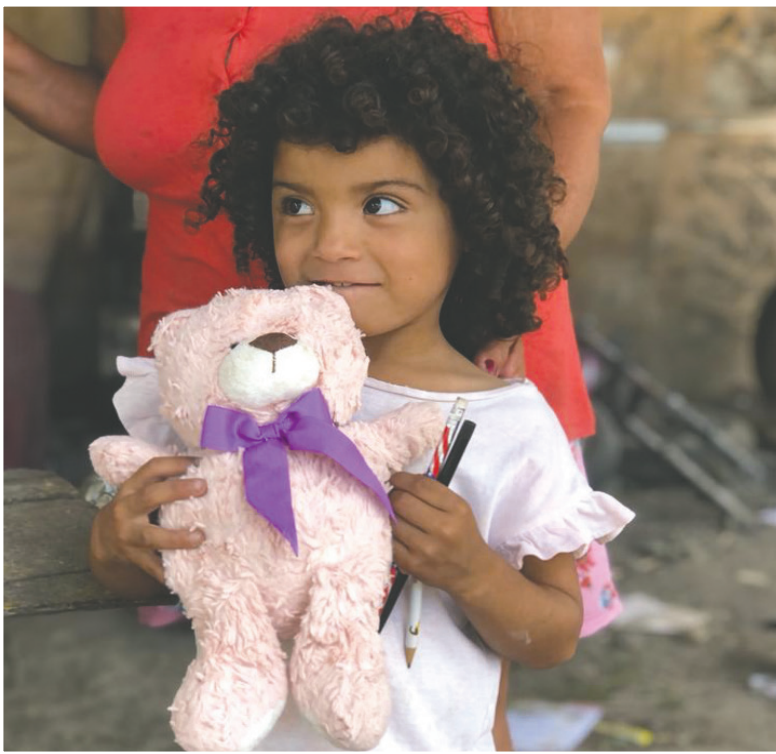
Smiling... just because