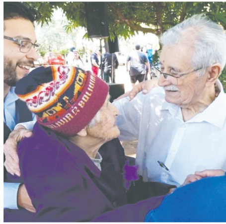
Caring for the elderly