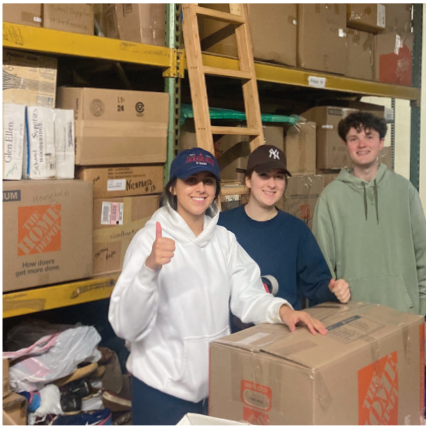
Sorting & packing donations...