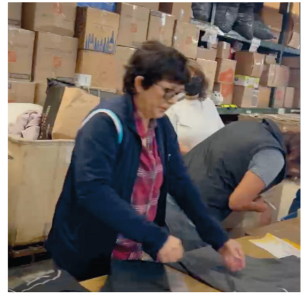
Packing cargo containers & trucks...