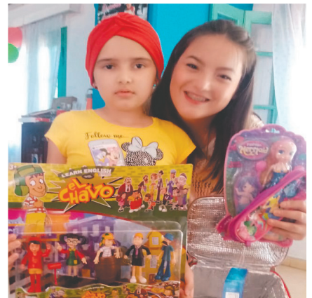
Organizing the WAREHOUSE STORE...